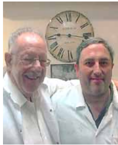
• Oscar and Tony

In November we hosted a short market visit and breakfast from the lady Mayor of Las Vegas